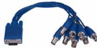
9-16 Cams Video Cable