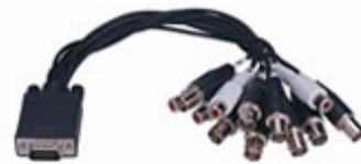
1-8 Cams Video/Audio Cable