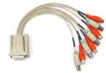
4 cam video cable